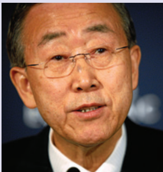
Ban Ki-moon, United Nations Secretary-General, during a press conference at the 2011 World Economic Forum in Davos, Switzerland

“In our world of plenty, no one should live in hunger. No child should have his growth stunted by malnutrition. No child should have her opportunity for a better life curtailed even before she is born, because her mother was undernourished.”