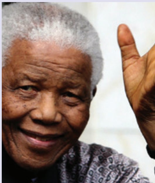
Nelson Mandela

“Hunger is an aberration of the civilized world. It is the result of civil wars, oppressive governments, and famines of biblical proportions. Families are torn asunder by the question of who will eat. As global citizens, we must free children from the nightmare of poverty and abuse and deprivation. We must protect parents from the horrifying dilemma of choosing who will live. Hunger is a basic need that must be met before anyone can escape the depths of ignorance, before any society can stand without aid, but more importantly, before any child’s body can survive the onslaught of disease such as the scourges of HIV, TB and malaria.”