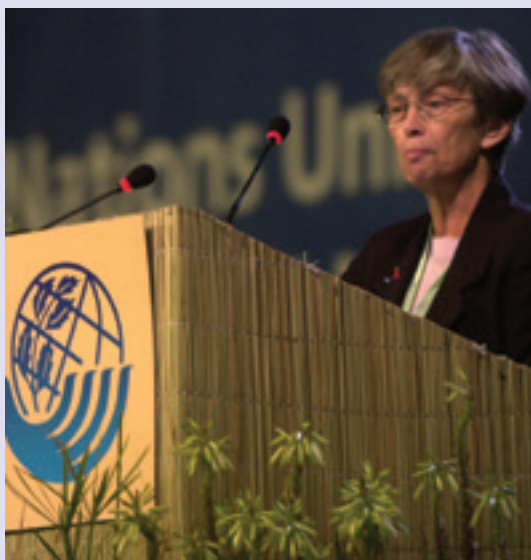
Carol Bellamy, UNICEF

“Vitamin and mineral deficiency (VMD) touches the lives of perhaps a third of the world’s people. After a decade of dramatic developments, the facts are known, the solutions are available, and the cause is one in which many individuals and organizations – governments, the private sector, the medical and scientific community, civil society – can all become involved. The challenge is therefore clear. And when so much could be achieved for so many and for so little, it would be a matter of global disgrace if vitamin and mineral deficiency were not brought under control in the years immediately ahead.”