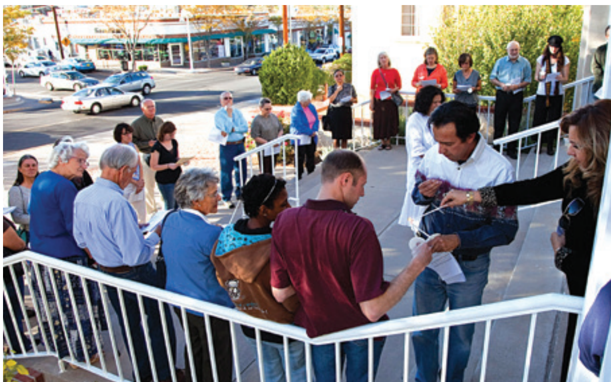
People hold a candlelight vigil at Immanuel Baptist Church in Albuquerque, New Mexico, on October 22, 2011, to pray for a Circle of Protection around US federal programs that help poor and hungry people in the United States and abroad.