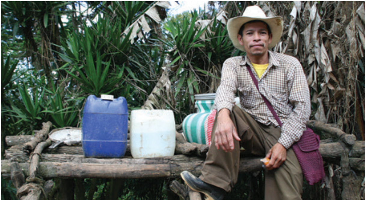
A villager poses for a photograph in Chiquimula, Guatemala. Chiquimula is in the Corredor Seco (Dry Corridor), an area near the Honduran border that recently suffered a severe drought, thus exacerbating poverty and malnutrition in a country that has the highest malnutrition rate in the Western Hemisphere.