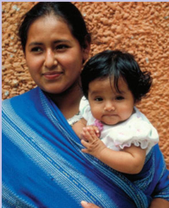
Guatemalan mother and daughter