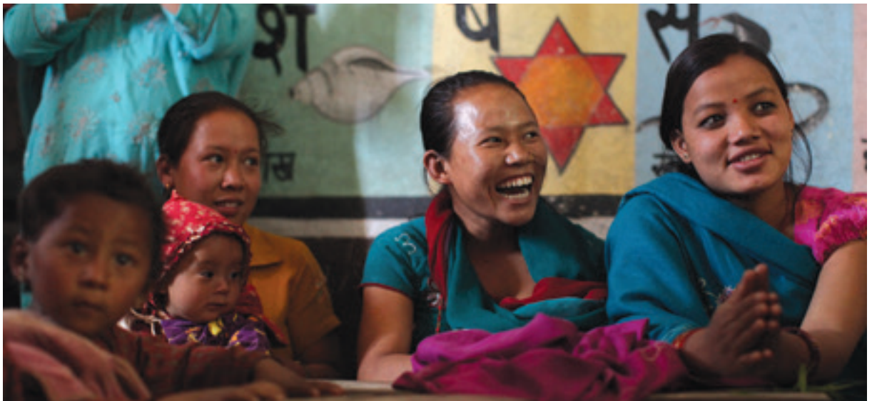
Mothers laugh during a nutrition education seminar hosted by Care Development Organization, a Nepali NGO that receives support from Maryknollers, in Bandarkharka, Nepal, on Friday, April 27, 2012. About 30 women plus their kids and grandkids attended the seminar.

In Peru, a coalition of civil society organizations called the Child Nutrition Initiative (CNI) has worked together to obtain commitments to reduce malnutrition among children under 5 by 5 percent in 5 years from the 10 presidential candidates running in the national elections in 2005 . They followed up with specific recommendations and a 100- day action plan for the newly-elected President Alan Garcia, who pledged to reduce malnutrition by 9 percent. To sustain political commitments, CNI also worked with other stakeholders, regional leaders and the World Bank, to build long-term support and commitment to nutrition. When