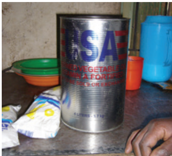
Can containing fortified vegetable oil

Sources: http://www.economist.com/node/21550328 , http://www.guardian.co.uk/lifeandstyle/2011/jul/17/bread-food-arab-spring